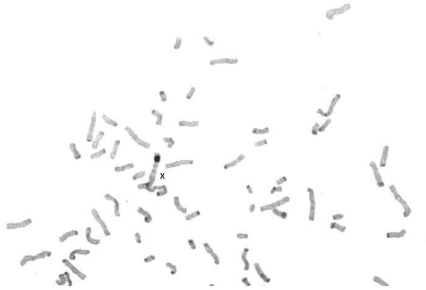
Figure S1. CTG banding of SR-iPSCs confirms large block of heterochromatin at the terminal end of the long (q) arm of the X chromosome. Related to Figures 1E and 1F.