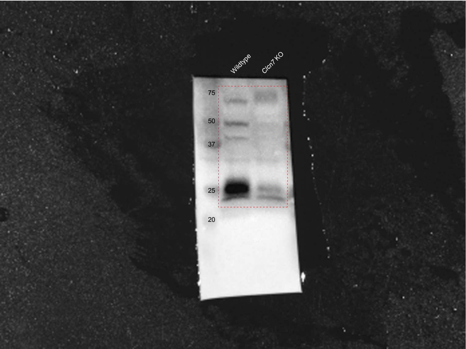
Anti-Cathepsin C antibody