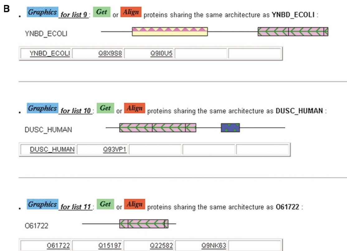
Figure 1. (Opposite and above). New graphical user interface for viewing protein matches of a particular InterPro entry. (A) Graphical view of representative list of proteins matching IPR000340, in which consensus domain boundaries have been computed for the domain line, and parent and children entries have been collapsed into one family line. This enables the family and domain composition information to be seen at a glance. (B) From the “more proteins in list” link in view a.) it is possible to show all proteins sharing a common domain architecture. These protein sequences can then be retrieved or their alignments can be visualised.

InterPro has developed an improved user interface for visualisation of the protein matches in a condensed graphical view derived from the ProDom graphical interface (4). The consensus domain boundaries are computed, and the resulting protein matches are combined rather than each signature being displayed (Fig. 1A and B). Parent/child related InterPro entries are collapsed into one line, while domain entries are shown on separate line, thereby providing a simple view of family and domain composition. From this view, all proteins sharing a